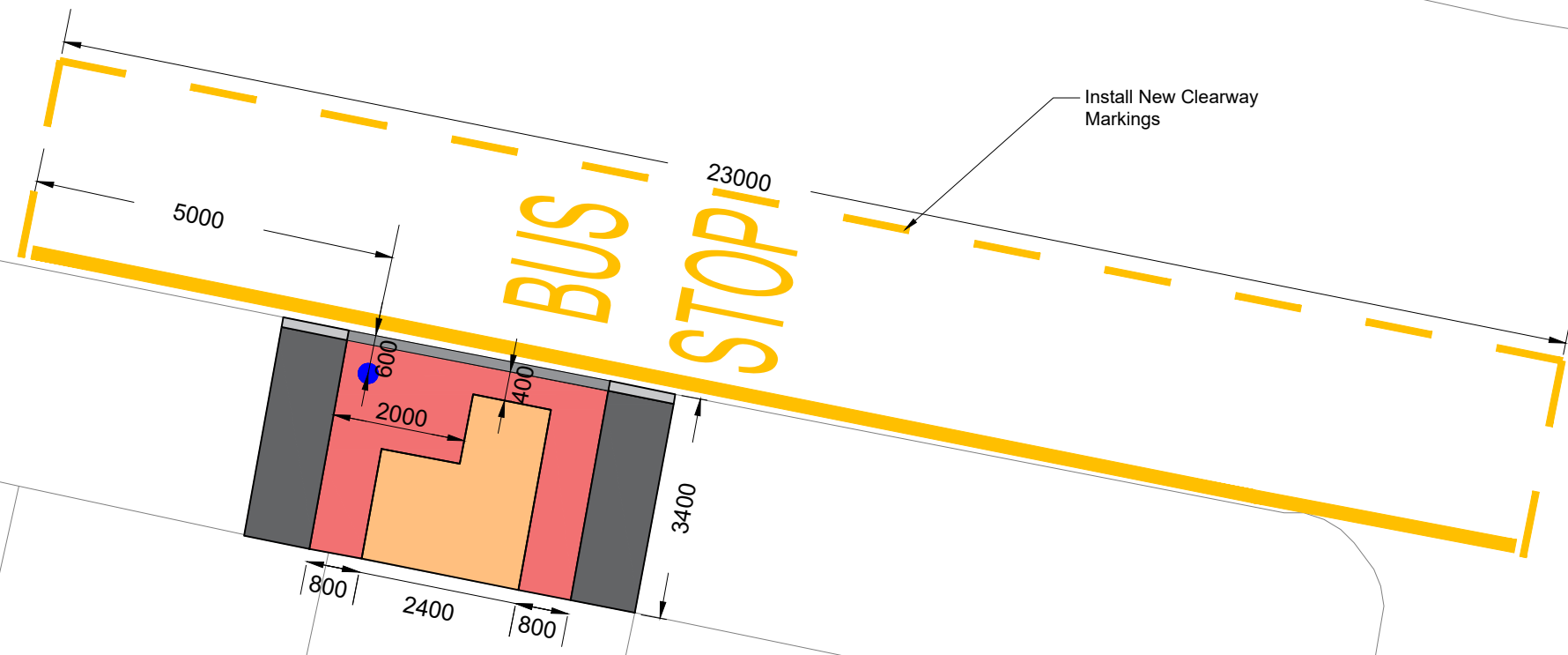
Bus Stop General Arrangement UPBS05